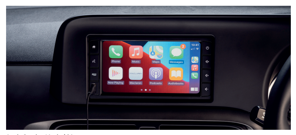
Apple Carplay / Android Auto

The new GRAND i10 comes standard with Apple Carplay / Android Auto and integrated Bluetooth. This infotainment system will keep you updated, up to standard and upbeat on every ride with integrated audio and Bluetooth controls.