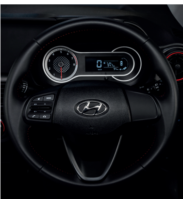
Multifunctional steering wheel