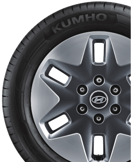
18-inch alloy wheels