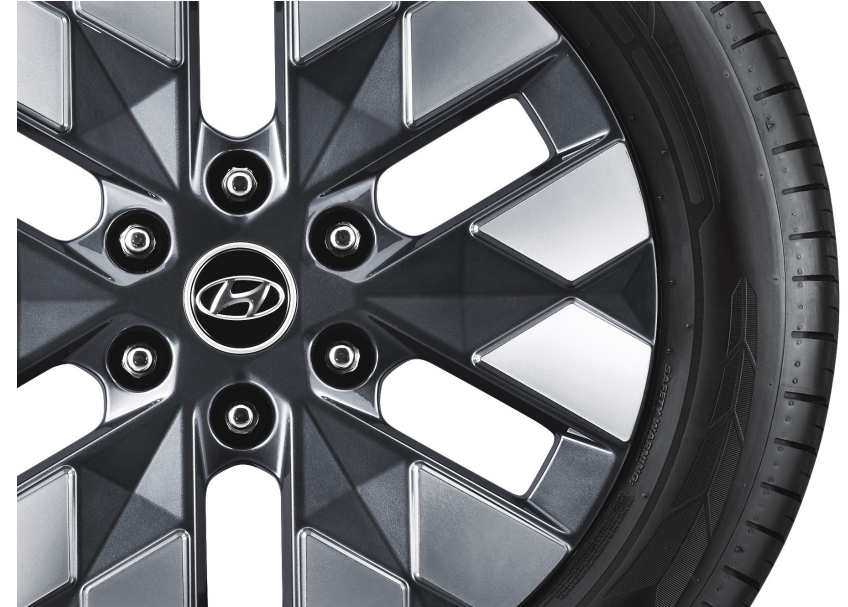
18-inch alloy wheels