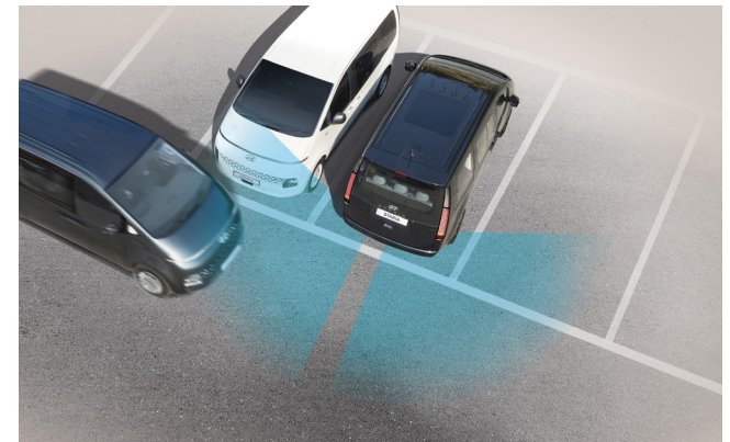
Rear Cross Traffic Alert