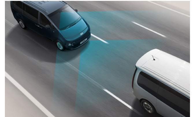
Forward Collision Avoidance