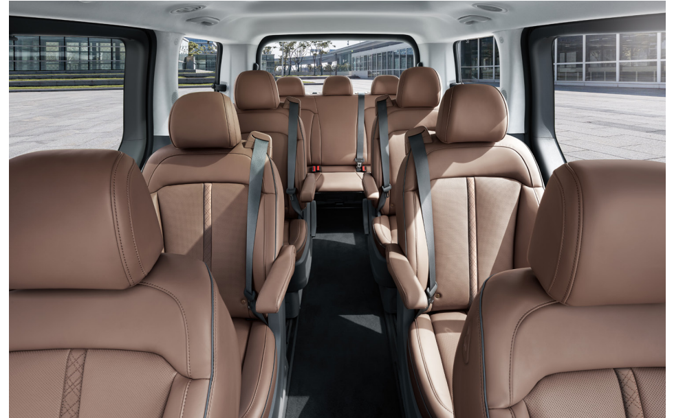
9-seater Luxury interior