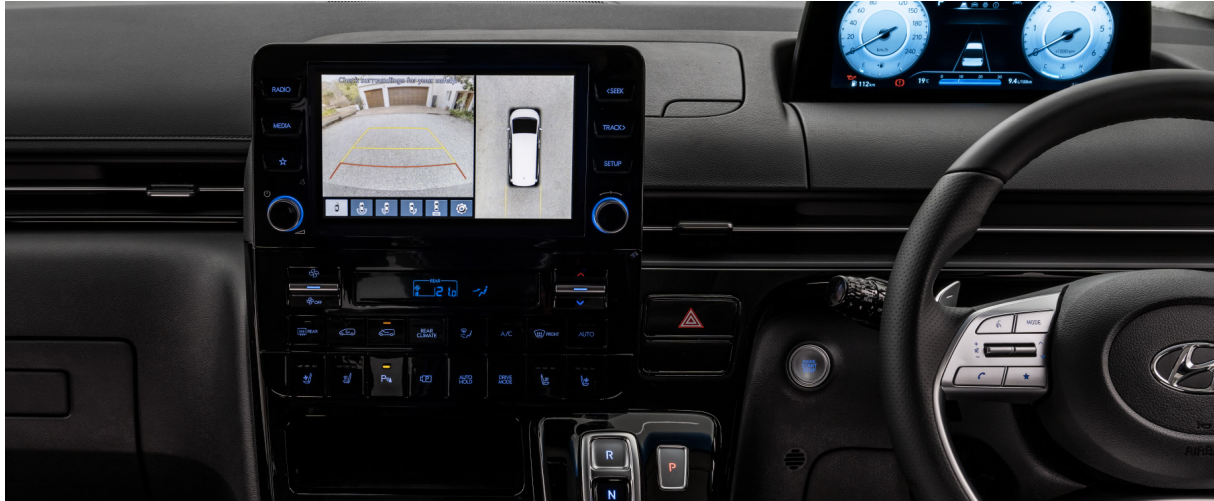
Surround view monitor

With a full 360 camera, the driver can enjoy an all-round view of the car's exterior and its surrounding environment, while passengers can sit back in luxurious Nappa leather finished seats. Comfort is of the highest priority with heated and ventilated front and second row seats and independent swivelling seats in the second row.