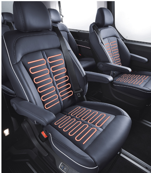
Heated and ventilated front and second row seats as well as independent swivelling second row seats