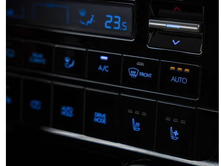
Auto climate control